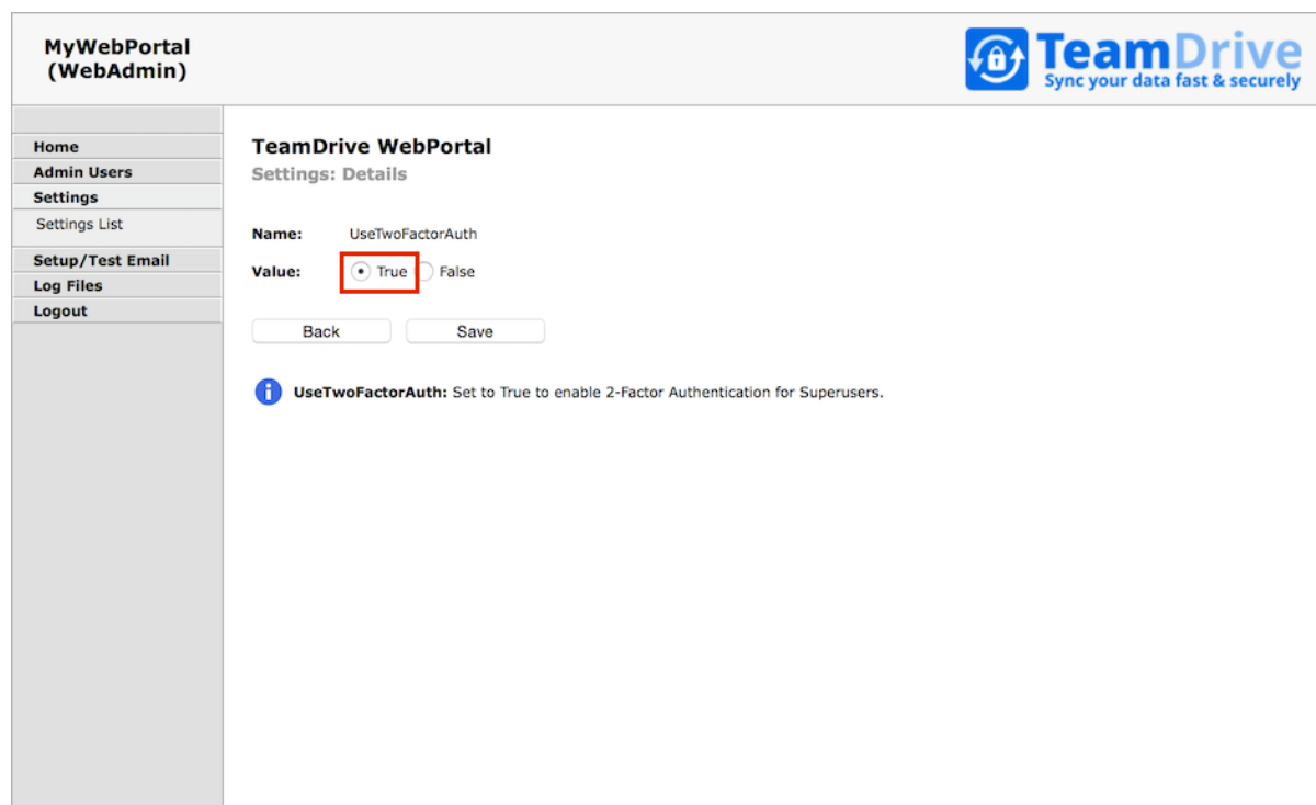
Fig. 4.5: Web Portal Admin Console: Use Two-Factor Authentication

This concludes the basic email configuration of the Web Portal. Now you can enable the two-factor authentication by clicking Settings -> UseTwoFactorAuth . Change the setting’s value from False to True and click Save to apply the modification.