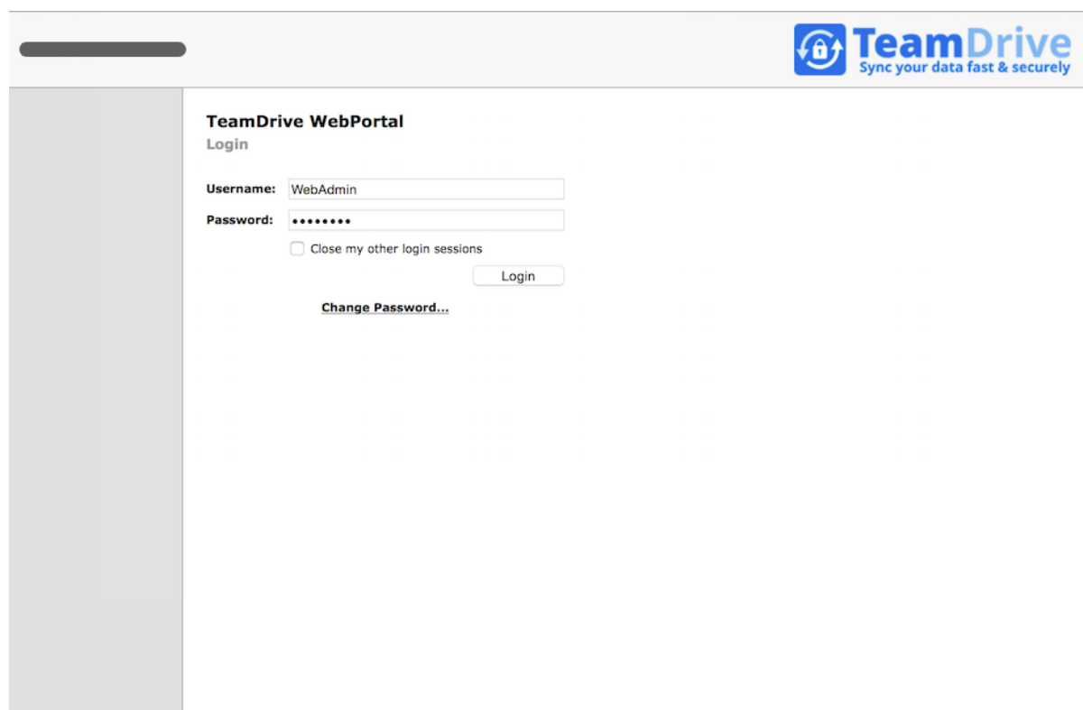
Fig. 10.2: Web Portal Admin Console: Login Screen

Upon successful configuration, you will be presented with the Web Portal's Administration Console Login Screen.